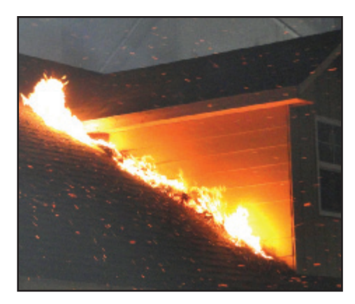
Leaves and needles burning along roof edge with dormer.