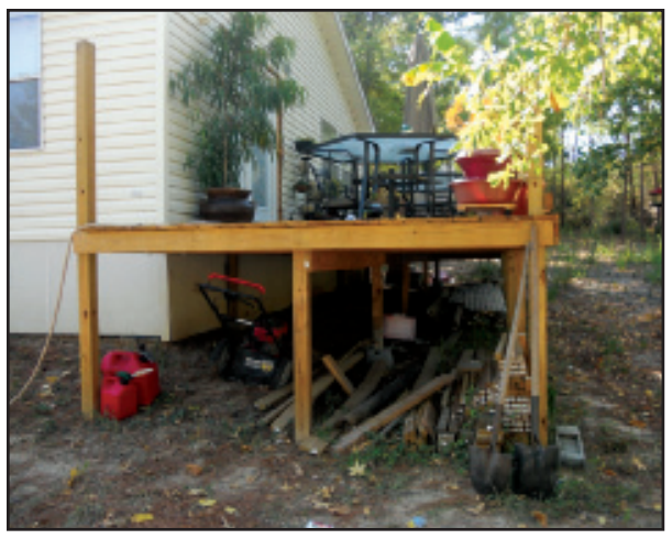
Materials under this deck could easily catch the home on fire.