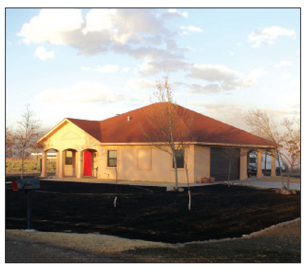
Firewise construction and landscaping helped protect this home from wildfire.

"Hardening a home" is a term used to describe the retrofitting process that reduces a home's risk to wildfire. This involves using non-combustible building materials and keeping the area around your home free of debris. The following pages will describe each section and offer alternative building materials that will reduce a home's risk to wildfire.