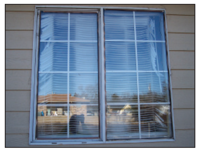
Radiant heat melted the interior blinds.

Window screens also play a vital role during a wildfire. They will absorb and redirect radiant heat, allowing the glass to absorb less. If the glass breaks, screens may also prevent embers from entering.