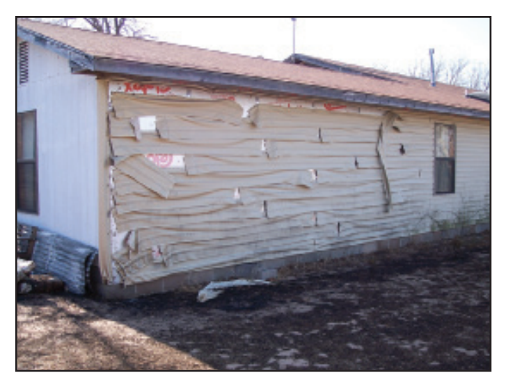
When this vinyl siding melted, it exposed other combustible materials.