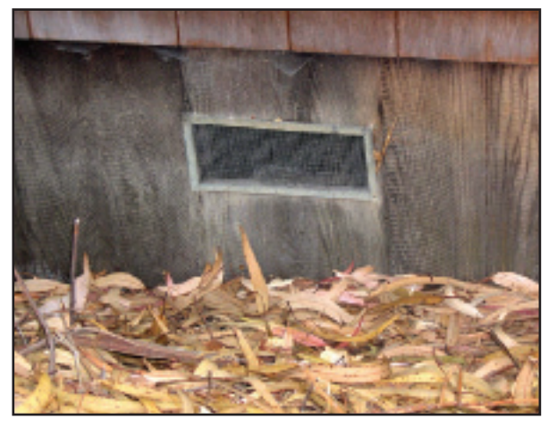
Combustible material like this mulch, near skirting or siding, leaves the home unprotected, even with screening in place.

There are several different types of vents for a home. These vents play a vital role by supplying openings for air to flow through. However, these vents can allow embers to enter a home during a wildfire.