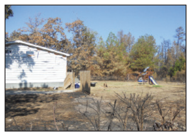
This home escaped the flames when firefighters knocked down the burning fence that would have led flames to the home. Notice the burn marks on the fence.