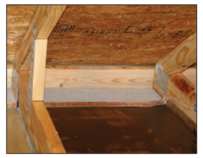
With roof edge flashing, fewer embers enter the attic area.