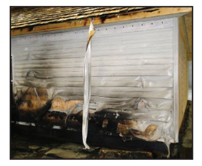
This vinyl gutter melted from heat, exposing the wood and roof edge to embers and direct flame.

Install gutter guards to keep debris from accumulating. Maintain the roof where the gutter connects to make sure debris does not accumulate between the guard and roof.