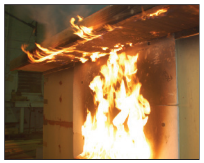
Direct flame on siding burns into the eaves and roof.

Angle flashing also should be used, as discussed in the roof section of this guide.