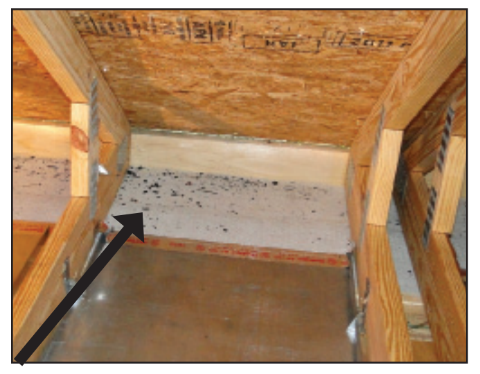
Without roof edge flashing, embers can enter into the attic.

Box in eaves with non-combustible material.