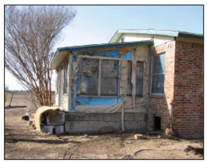
The vinyl siding and window frame on this home melted when exposed to radiant heat.

Use non-combustible siding and make sure there are no crevices or holes that could potentially catch embers.