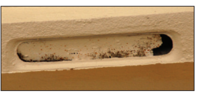
Vents can clog. This vent was painted over, reducing its effectiveness in providing ventilation.