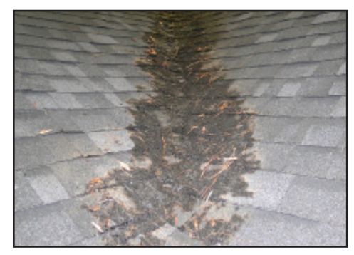
The pine needles on this roof burned, but the Class A roof did not.

The roof is one of the most vulnerable areas of a home. It is a large surface that is capable of catching embers during a wildfire. A roof also can collect dead vegetation such as pine needles and leaf litter, which will readily ignite. So the maintenance of a roof is as important as the materials used to construct it.