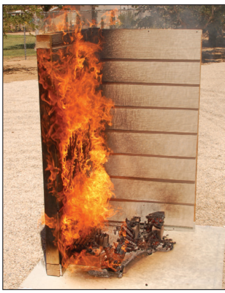
This photo shows the difference between combustible siding (left) and fiber cement siding (right) when exposed to the same direct flame source.

The exterior walls of a home will need to be resistant to radiant heat and direct flame contact. For homes with vinyl siding, the radiant heat from a wildfire may become intense enough to melt the siding. This could possibly expose crevices in a home and allow embers to enter.