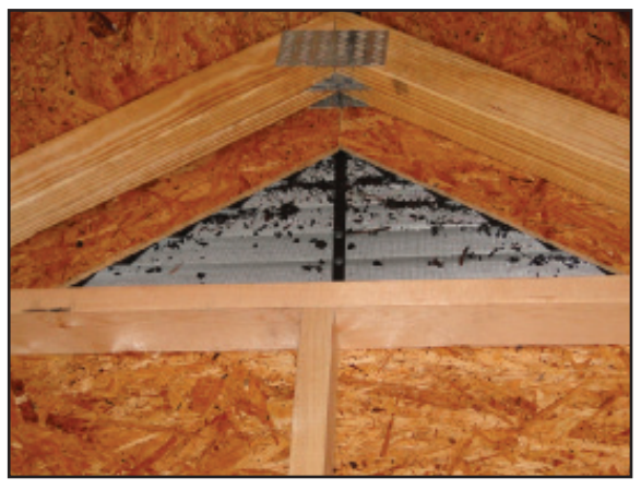
Screening helped capture these embers and prevent their entry into the attic.